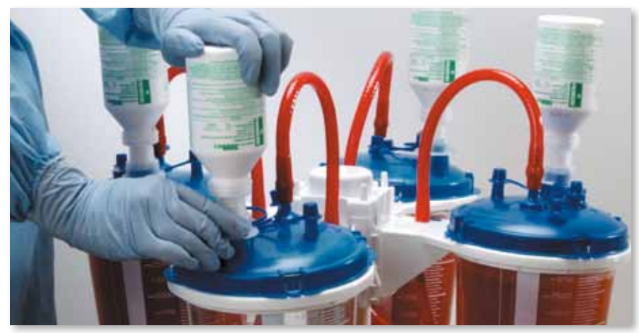
The PremiGuard Cap helps eliminate unnecessary spills, protecting healthcare workers from exposure to hazardous aerosolization. It can be used under gravity feed or the suction method.