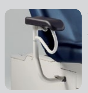
djustable Arm System Offers patients a stable latform in accessing the able and sense of security uring positioning. Arms otate and lock into one of three positions and are easily removable.