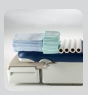
Supply Storage Midmark Barrier-Free<sup>®</sup> tables provide storage for up to four paper olls. The Supply ssistant rear storage drawer provides ample room for bulky supplies.