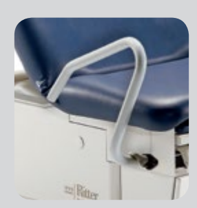
Assist Handles Offers patients a stable platform for accessing the able and a sense of security g positioning.