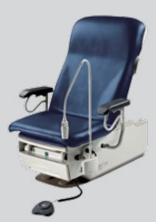
Ritter 253 LED Exam Light Easy access controls, high intensity light and an adjustable focal spot makes the Ritter 253 the perfect complement to any procedure room. Available in table mount and mobile options.