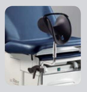
Standard Knee Crutches Swivel to provide leg upport for extended ocedures where fatigue a factor or when the ient lacks sufficient g strength or control.