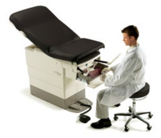
Ritter 223 Barrier-Free<sup>®</sup> Power Examination Table