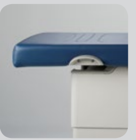
Flat Upholstery Provides an excellent working surface for orthopedic, chiropractic or osteopathic uses.