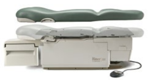
Removable Upholstery Top Allows for a color change in seconds or additional access for a thorough cleaning. It is easy to remove without the need for tools.